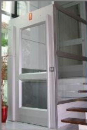
AL3 - Glazed door in natural anodized aluminium with cross bar and 2 glass panels