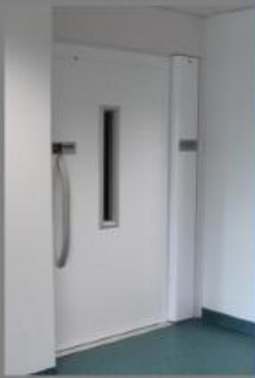
EI60 - Fire resistant door with small glass vision panel 1hr fire rated