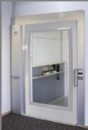
EI60G - Fire resistant door with panoramic glass panel 1hr fire rated