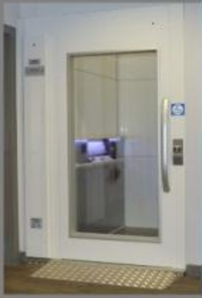
A20 - Steel door with a panoramic glass panel